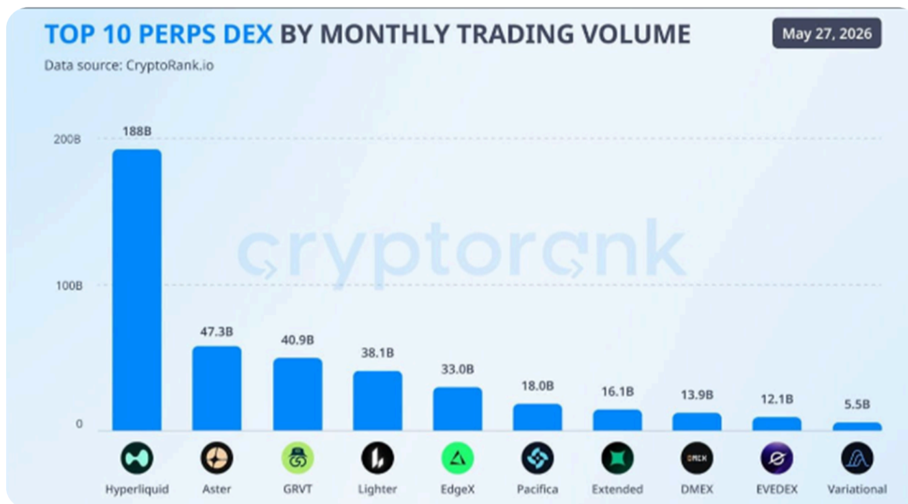
HYPE’s undisputed leadership in the DeFi world

The DEX share of total futures trading volume has nearly tripled over the past two years, confirming that HYPE and the DeFi ecosystem are perfectly capable of living their own life, detached from Bitcoin’s local depression.